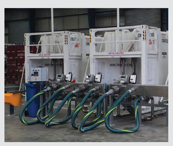
The LFT series are built to suit and comply to Australian, African, US and Asian markets.

► All tanks are intermodal. Standard containers can be transported by standard trucks or trains and moved by shipping container handling equipment, without cranes.