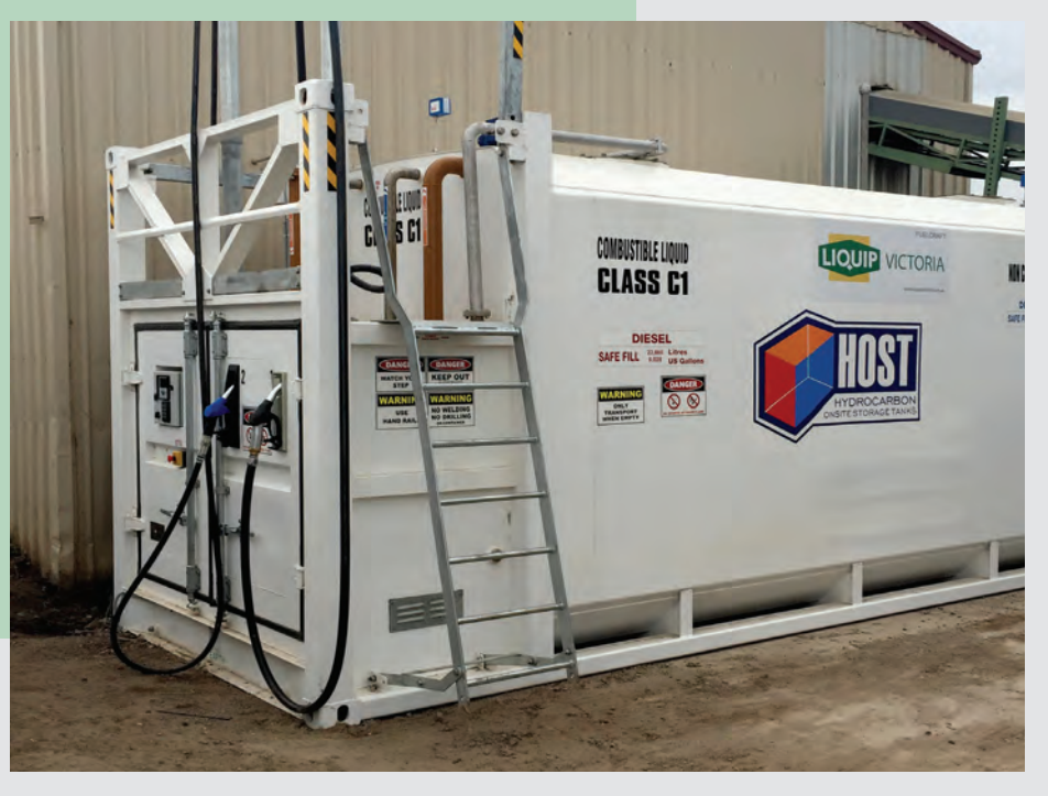
HOST ISO Classic LFT30 DA – Safely store and dispense Diesel and AdBlue (DEF) from the same self bunded tank. The LFT30 DA has safe fill capacities of 22,990L Diesel and 4,500 L AdBlue.